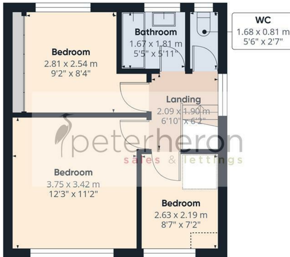
First Floor Building 1